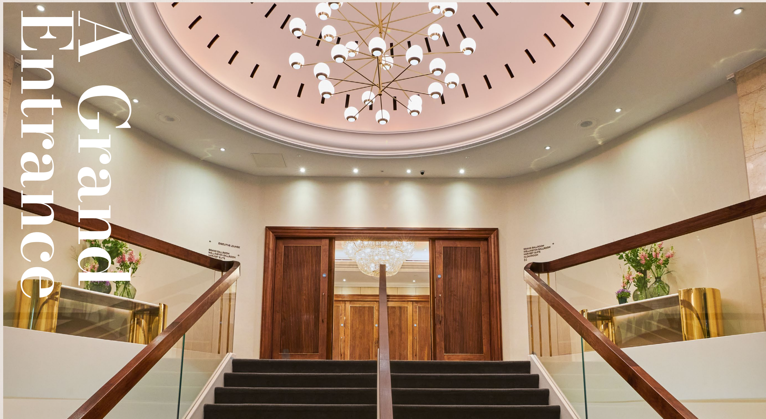
Grand Ballroom Staircase Make a grand entrance in the statement setting of this magnificent sweeping double staircase.