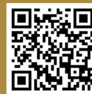
Scan QR Code for festive reservations

Estate: +65 6831 6270 Ginger.Lily: +65 6831 6273 Osteria Mozza: +65 6831 6271 hiltonsingaporeorchard.com/ festive2022